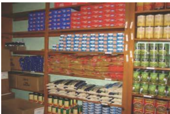
PANTRY STORAGE ROOM