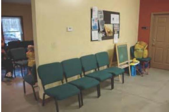
CLIENT WAITING AREA

The following is an example of the Supermarket Model Client Choice Pantry. This pantry is quite large, serving approximately 2,300 clients each month, and their facility is 4,000 square feet, which includes storage space.