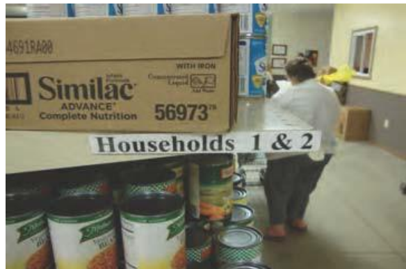
CHOICE ITEMS FOR A FAMILY OF 1 OR 2