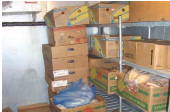
COLD FOOD STORAGE