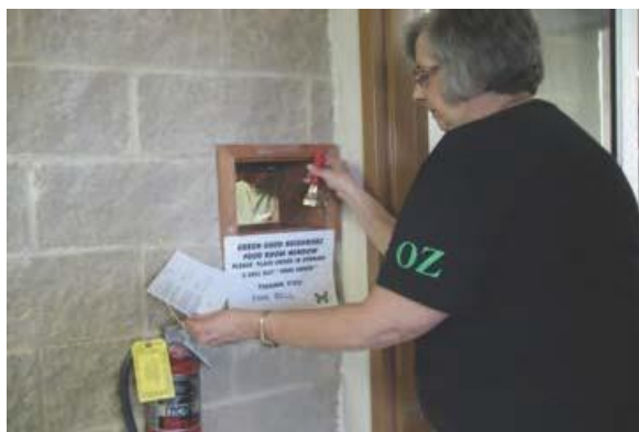
CLIENT SUBMITTING CHOICE ITEM SELECTIONS