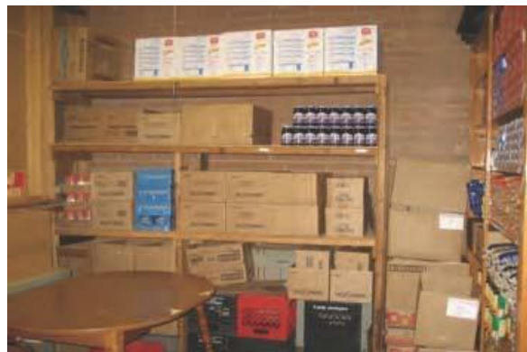
FOOD STORAGE AREA