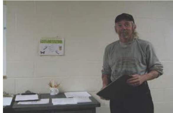
CLIENT RECEIVING INTAKE FORMS