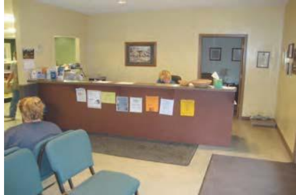
CLIENT INTAKE STATION