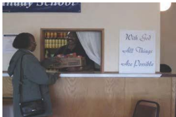
CLIENT PICKING UP GROCERIES