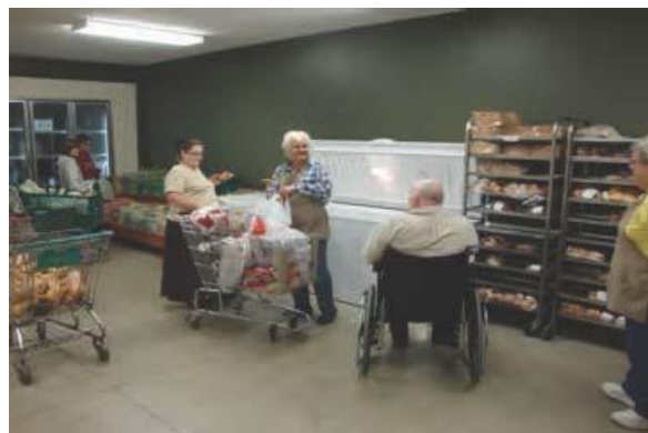
FROZEN FOODS & BREAD SECTION