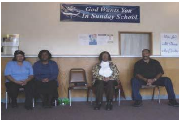
CLIENT WAITING AREA