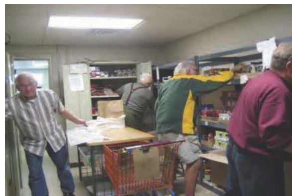
VOLUNTEERS FILLING CLIENT'S CHOICE ITEM SELECTIONS