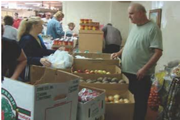
CLIENTS SHOPPING FOR PRODUCE CHOICE ITEMS