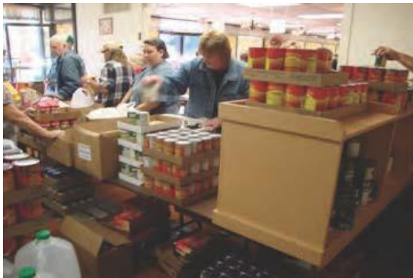
CLIENTS SHOPPING FOR CANNED FOOD CHOICE ITEMS