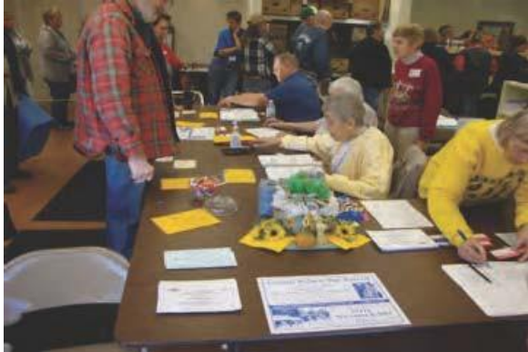
CLIENT INTAKE STATION

Here is an example of a Table Model Client Choice Pantry. This pantry has 900 square feet, serving 250 to 300 clients each month.