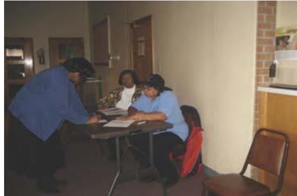
CLIENT INTAKE STATION