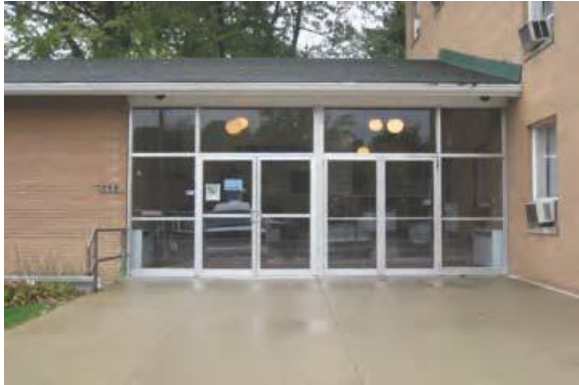
ENTRANCE OF CHURCH

Here is an example of a Window Model Client Choice Pantry. This pantry is small, serving approximately 145 clients a month with a 468 square foot waiting room and a 180 square foot storage room.