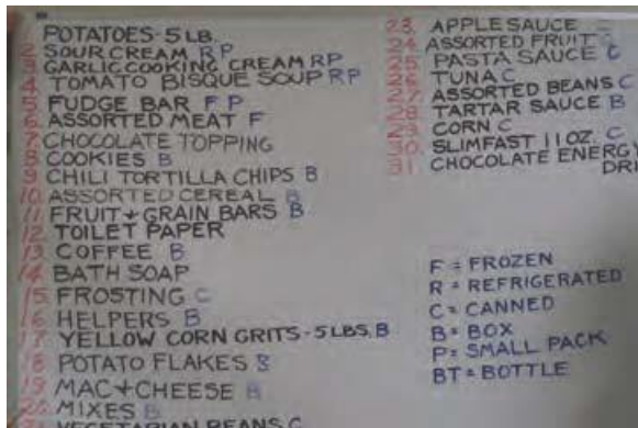
CHOICE ITEM SELECTION BOARD